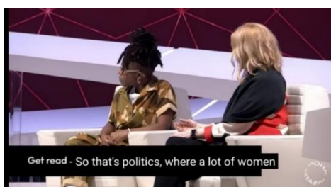
Picture 9. Women have aspirations to join the government but women don't necessarily want to pilot fighter jets, be soldiers, fix the roof of a house and we have different aspirational interests. So we are forced to implement quotas for equality. Duration 46:41-48:25

Based on the results of the research this data is included in the structural and relevance principle where there are claims and reasons given in the argument to clarify the purpose of the argument so that the audience can accept and understand the core of the speaker's argument. as in the following sentence "I think it exists in many different cultures" the statement is a claim contained in the speaker's argument accompanied by reasons. As Damer said structural principle is a claim contained in the argument while relevance is a claim that