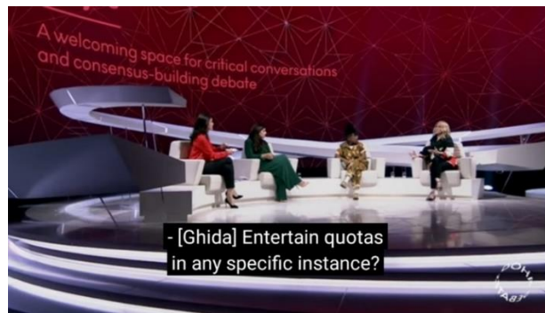
Picture 11. Quotas cannot help gender equality. Duration 54:55-56:38