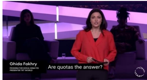
Picture 1. Quotas can be a solution to achieve gender equality. Duration 12:01-21:48

This data is the speaker's argument related to the issue of gender equality and there are four types of Damer principles: structural, relevance, acceptability, and sufficiency principle. In this data, there are premises that are related to each other and provide accurate evidence based on statistical data and speakers' experience to strengthen the argument submitted so that the audience can accept and understand the meaning of the argument delivered. 7