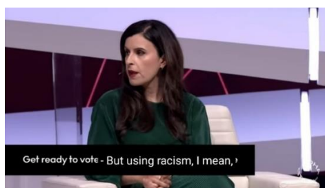
Picture 7. Gender inequality does not only speak to the upper class but also to racism. Duration 46:41-48:25

This data is included in the sufficiency principle because there is accurate evidence presented by the speaker to prove that the argument is true so that the audience can believe in the speaker's argument. As in the following sentence "94.4% of our elected members of parliament have Anglo backgrounds," this data is evidence that the speaker's argument is accompanied by evidence. So researcher classify this data in the sufficiency principle as said by Damer 12 .