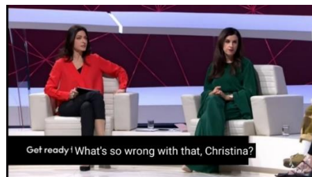
Picture 8. We are talking about the real effects of implementing quotas as a solution to gender equality. Duration 44:31-45:45